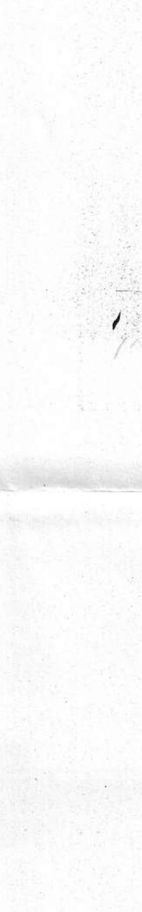
SECTION ON A-A SCALE: 1:100